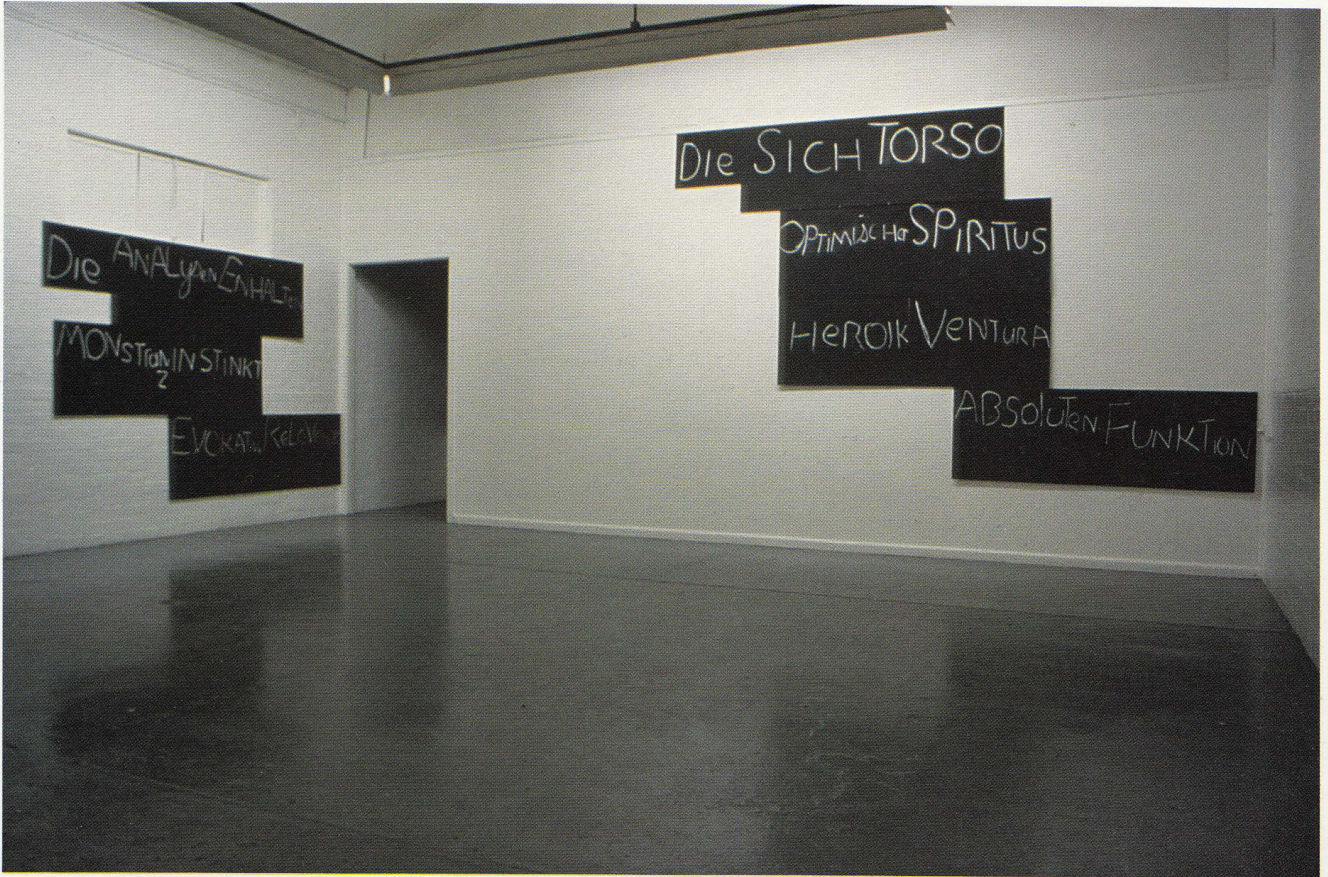
Diena Georgetti wie so primitiv, wie so sensibel , 1992 (detail) Chalk on masonite Installation comprised of panels in two sizes, 41 x 52 cm & 60 x 91 cm